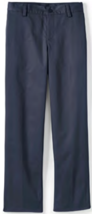
long pants or shorts *NO SHORTS Nov-March