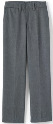
long pants only