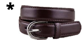
*belt must be worn everyday 3rd-6th optional K-2nd