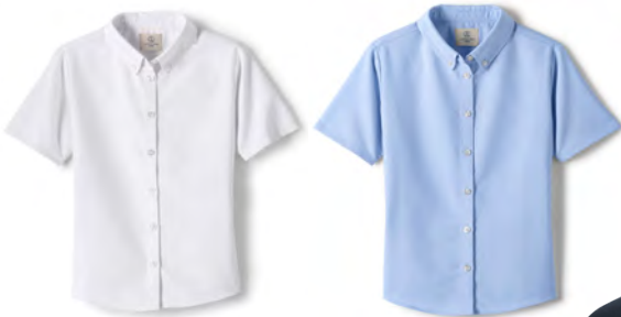
long or short sleeve traditional collar with or without collar buttons