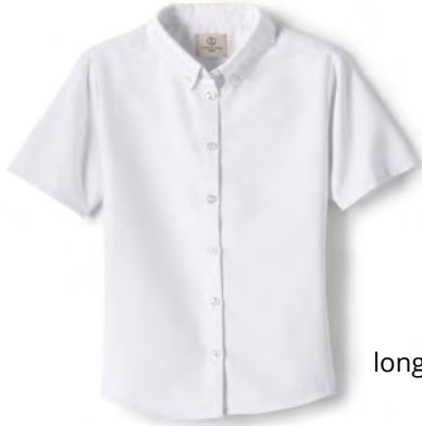
long or short sleeve traditional collar with or without collar buttons