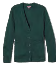
cardigan can be green or navy