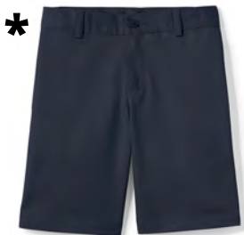
*NO SHORTS Nov-March

Shorts may be grey, black, navy or forest green. No specific brand or vendor requirements.