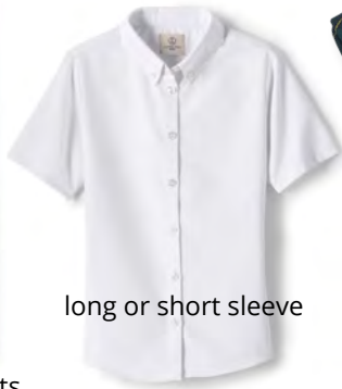
long or short sleeve