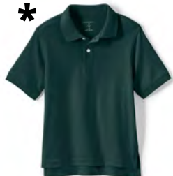
*Forest Green Polo Needed for field trips