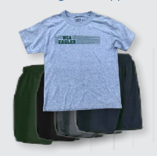
Shorts may be grey, black, navy or forest green. No specific brand or vendor requirements.